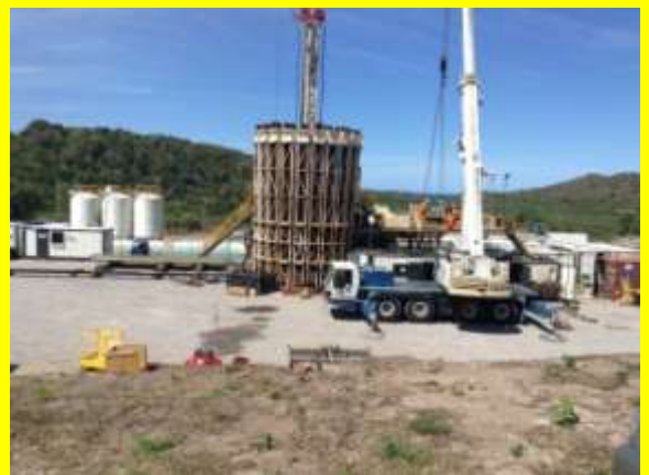
The drilling in Montserrat