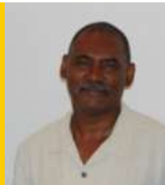
Honourable Rueben T Meade, Premier of Montserrat

According to Mr Meade, The Montserrat Development Department, a delegation which accompanied him on the trip, signed the letter of intent with the Dubai-Based Gulf Classic Ltd.