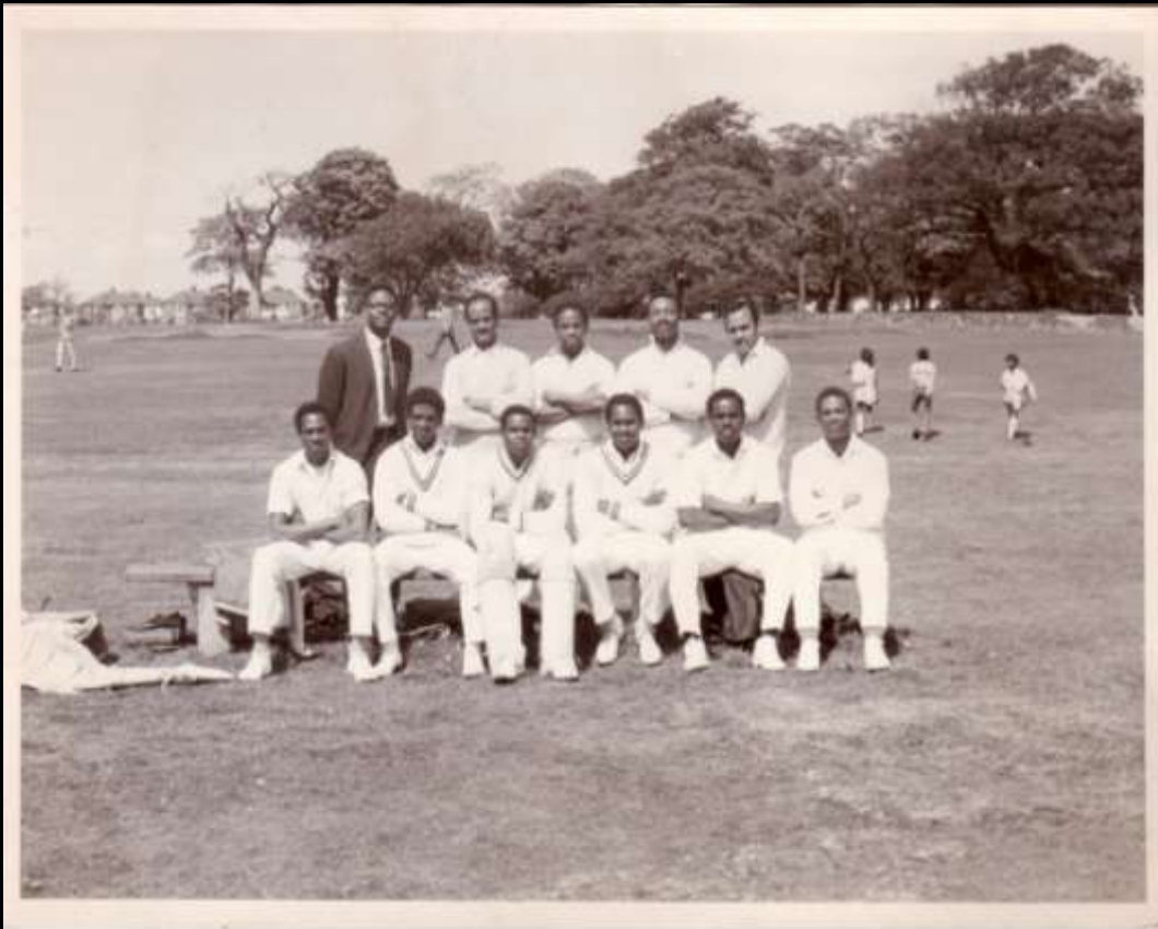
Can you name the team, the players, the year and the location?? Answers in the next issue.